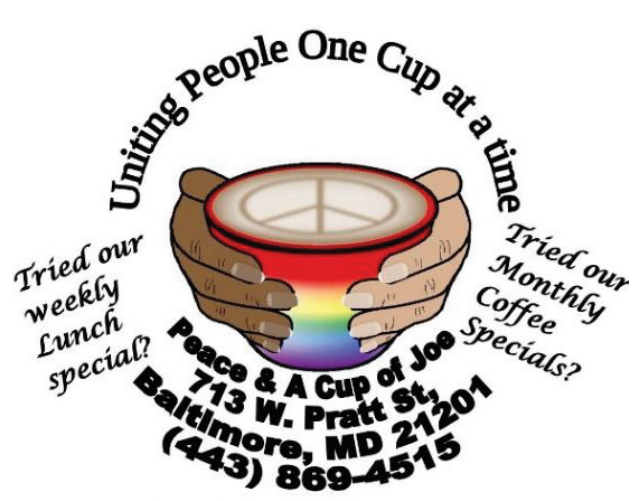
peaceandacupofjoecoffee.com Open 7am-7:30pm Mon.-Fri. • 8am-6:30pm Sat.-Sun.

With an eye towards sidewalk beautification and neighborhood outreach, the Block Captain program is being rolled out in 2019. From time to time, the block captain will assist with safety reminders such as outdoor lighting, or notifications about alley cleanups. Ideally, every block can have a captain and if you are interested in assisting, please email President@ ridgelysdelight.org. The position counts towards membership in good standing.